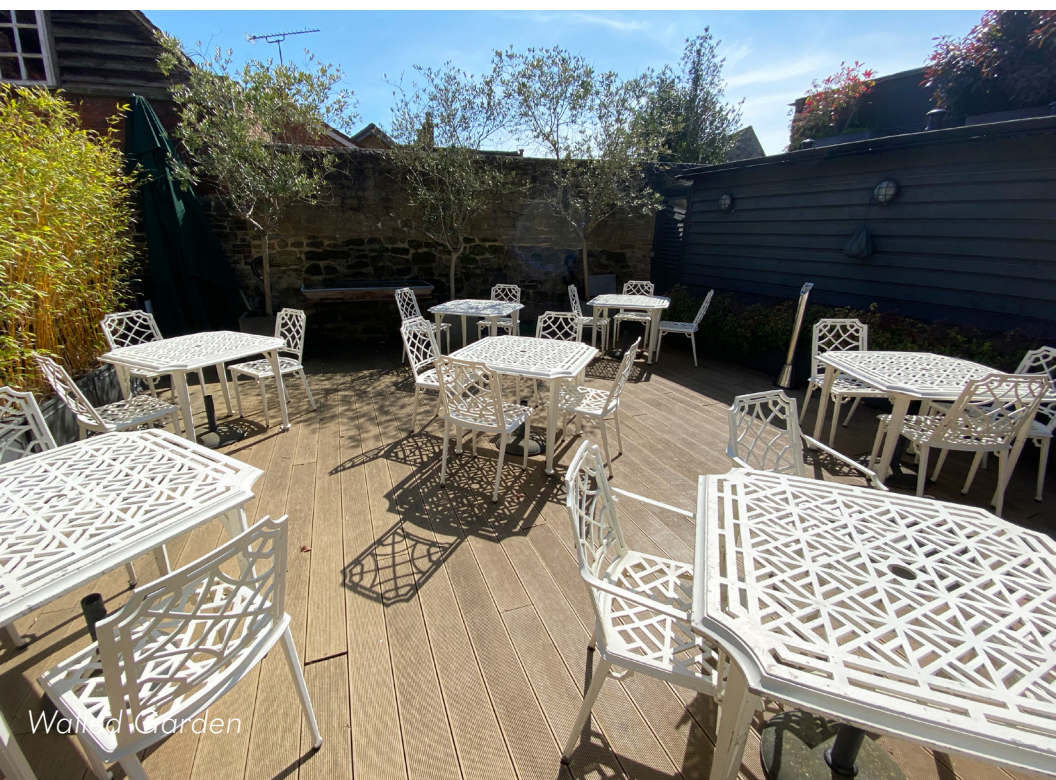
Walk in Garden