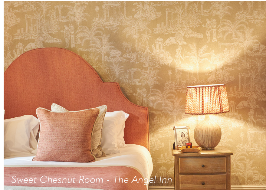
Sweet Chesnut Room - The Angel Inn